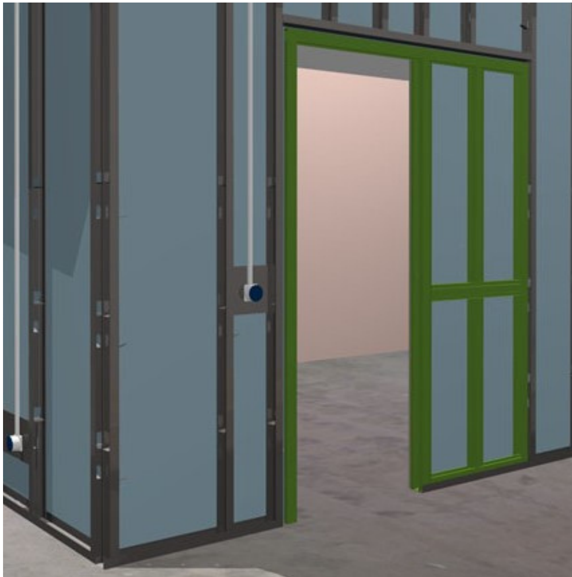
Building systems and Liune pocket doors